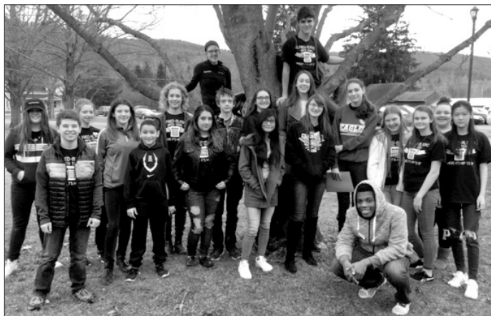
Members of the A-A Math Team visited Houghton College.

Twenty members of the Alfred-Almond Math Team attended Math and Science Day at Houghton College on February 15. There, students participated in the American Mathematics Competition. They also learned about applications of math and science, including how geometry and origami are used to install airbags and transport satellites. Results from this national math contest will be announced later in March.