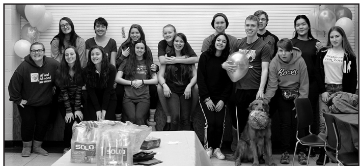
The set up crew.